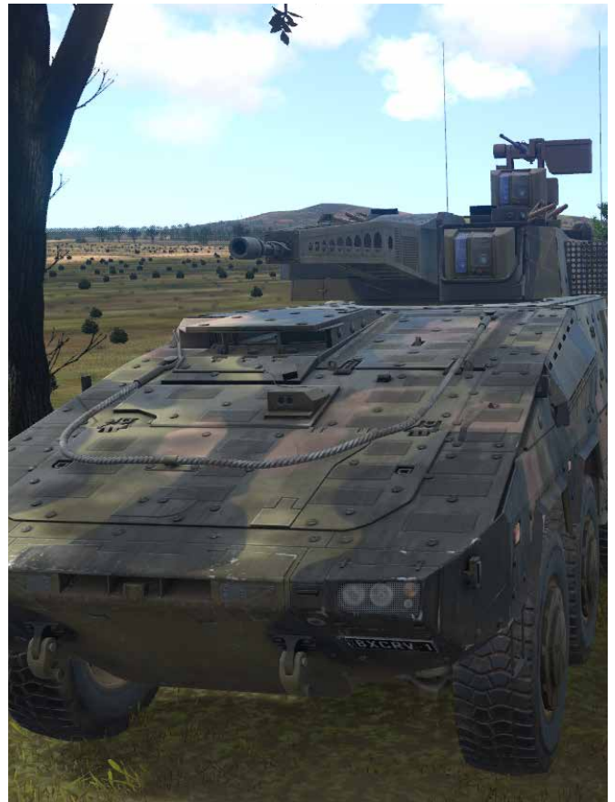
Bohemia Interactive Simulations

These Defence primes provide through-life sustainment for Defence and market leading niche defence suppliers.