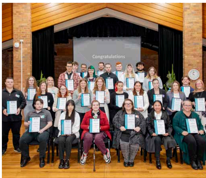
Hunter TAFE Foundation Scholarships and Awards Presentation

In 2022/23, the Foundation awarded a total value of $81,564 in scholarships and awards to 69 worthy recipients and we look forward to growing this support to TAFE learners together with our partners.