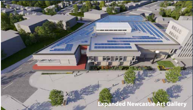
Expanded Newcastle Art Gallery

We're spending $7.7 million on stormwater upgrades to address flooding to property and businesses in areas such as Mayfield East and Darby Street and $6 million for improving Newcastle's cycleway network and transport options.