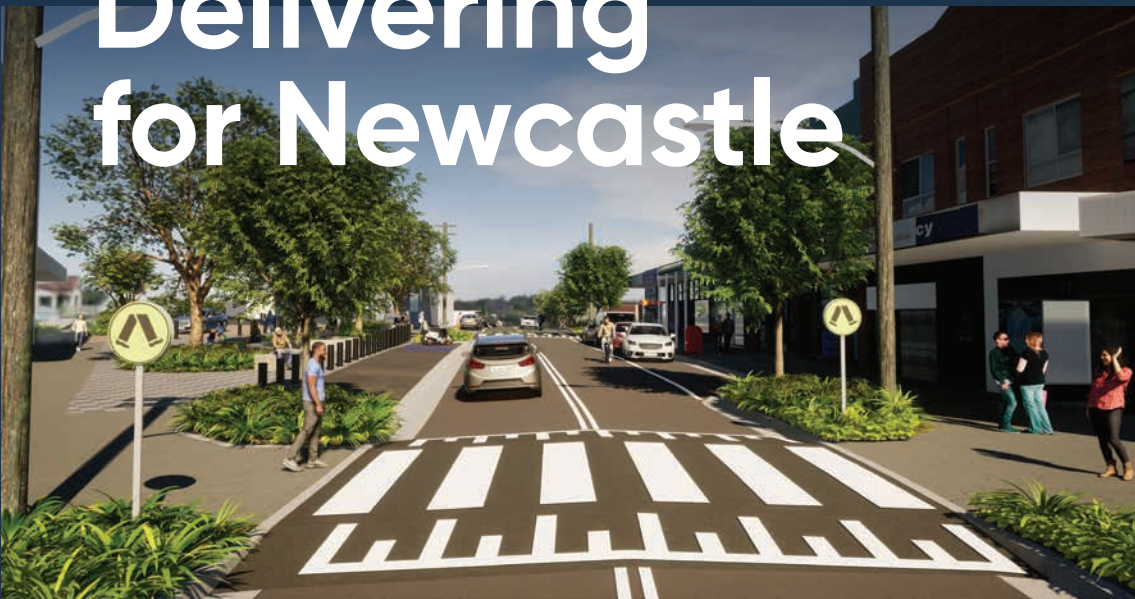
Artist impression: Georgetown Local Centre renewal, part of City of Newcastle's $140 million infrastructure investment for 2024/25.