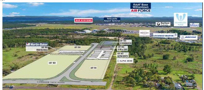
Williamtown Aerospace Centre Precinct 52

"These emerging Defence SME companies continue to flourish and grow Williamtown Aerospace Centre as a Defence Technology cluster."